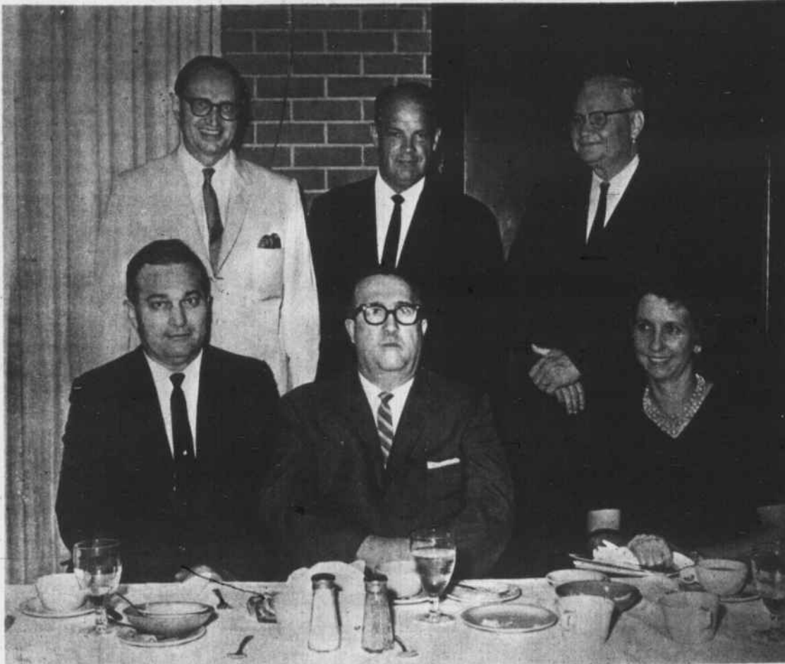
Principals At Business Meeting

Tel. GY 6-3283 (Ten Cents) Louisburg, N. C., Tuesday, August 3, 1965 (Six Pages Today) 96th Year—Number 47