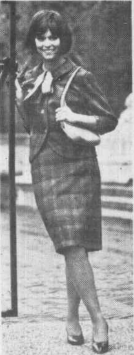
Young favorite, plaid, appears here in a dress with slim skirt, body-skimming jacket. Fast-color, easy-care fabric is by Dan River. Photo from Textile Dye Institute.

Young Favorite, Plaid, Appears here in a dress with slim skirt, body-skimming jacket. Fast-color, easy-care fabric is by Dan River. Photo from Textile Dye Institute.