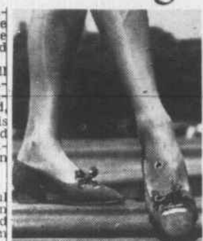
Teens take to the ghillie this fall in styles like this mid-heeled tassel version with the new, rounded look, in reverse calf. By I. Miller.

Most people are ready to spend somebody else's money.