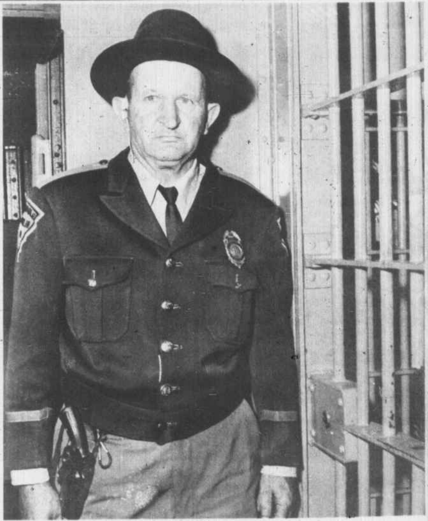
Tough On Escapees

Nearly a half million rural electric consumers will be represented at the meeting by members of the 79 rural electric systems serving the nine Region I states.