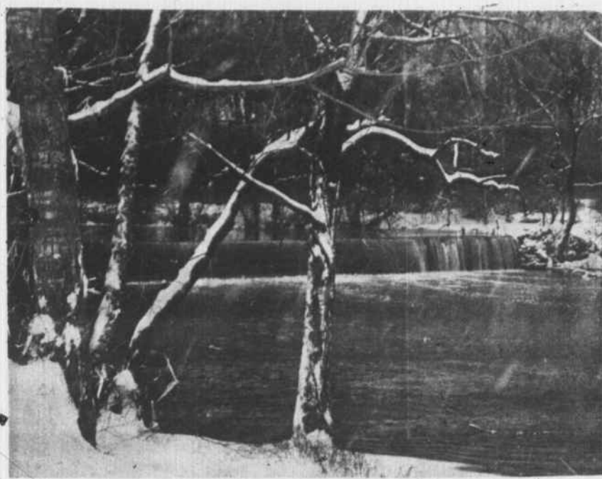
Tar River Snow Scene