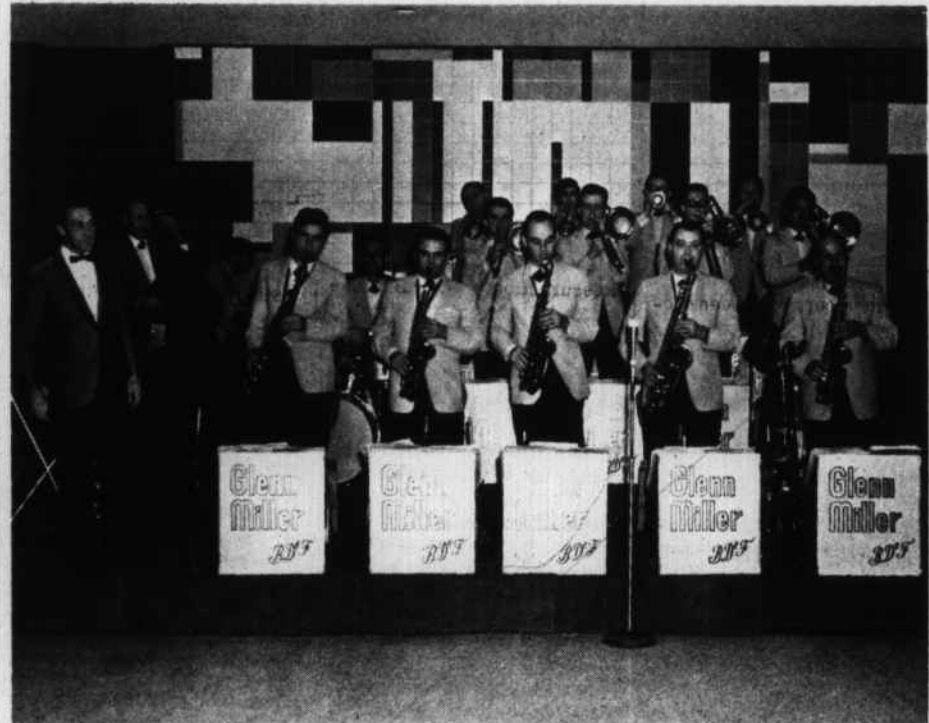
The Glenn Miller Orchestra