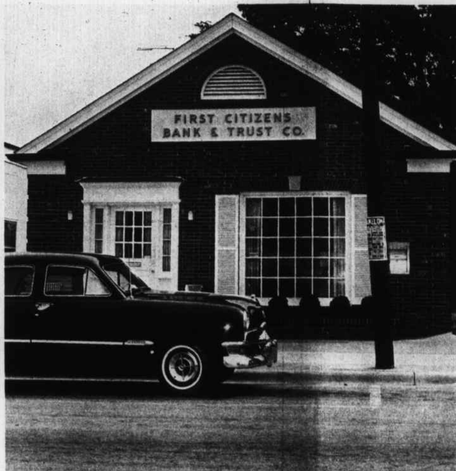
Bunn Bank Bunn branch of First-Citizens Bank and Trust Co. is shown above last Friday morning about 15 minutes after it was robbed by a Negro youth. Two other men were believed involved in the robbery, but gained their escape in a car which has not yet been found. SBI agents, tipped beforehand of the robbery, were inside the bank, but the fleet-footed Negro escaped, dropping the money in the process. A 20-year-old Negro from Columbia, S. C. was picked up late Friday night and charged in the robbery.