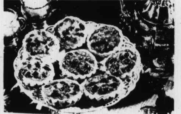
RAISIN PARTY TARTS

1 cup California dark seedless raisins 1 lightly beaten egg 1/2 cup sugar 1/8 teaspoon salt