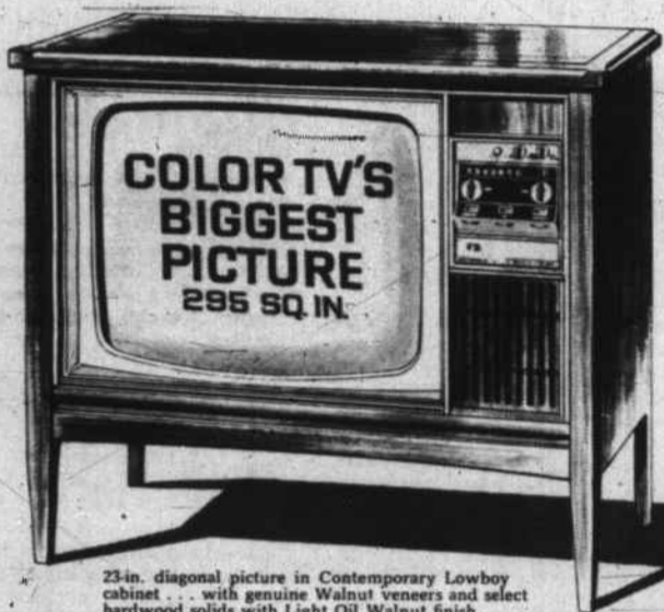
23-in. diagonal picture in Contemporary Lowboy cabinet... with genuine Walnut veneers and select hardwood solids with Light Oil Walnut finish.