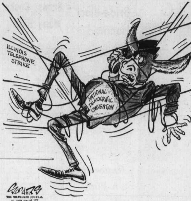
Don't worry, Mayor Daley, I AM hanging on!