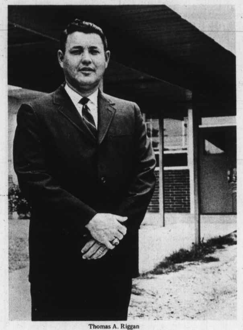
New Principal Tours School