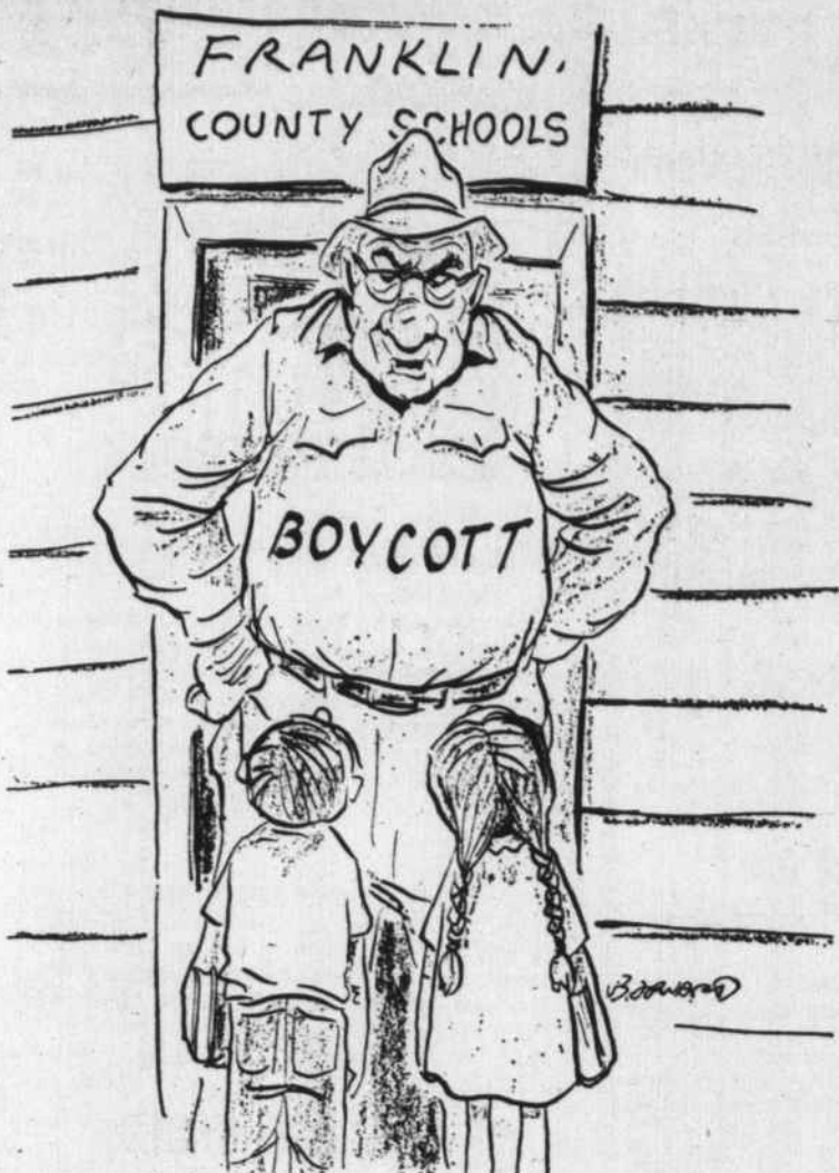
The News and Observer, Wednesday, August 28, 1968

"Tell Your Kinfolks—No $40, No Public Education."