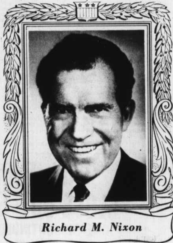
Richard M. Nixon