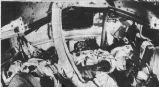
LUNAR LIE-DOWN: Calmly poised for a dry run of their coming orbit of the moon are Apollo 8 astronauts, left to right: William A. Anders, James A. Lovell Jr. and Frank Borman.