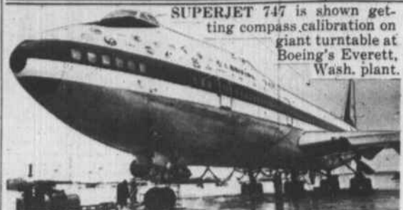
SUPERJET 747 is shown getting compass calibration on giant turntable at Boeing's Everett, Wash. plant.