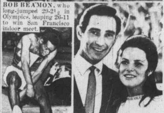
BOB BEAMON, who long-jumped 29-21 1/2 in Olympics, leaping 26-11 to win San Francisco indoor meet.