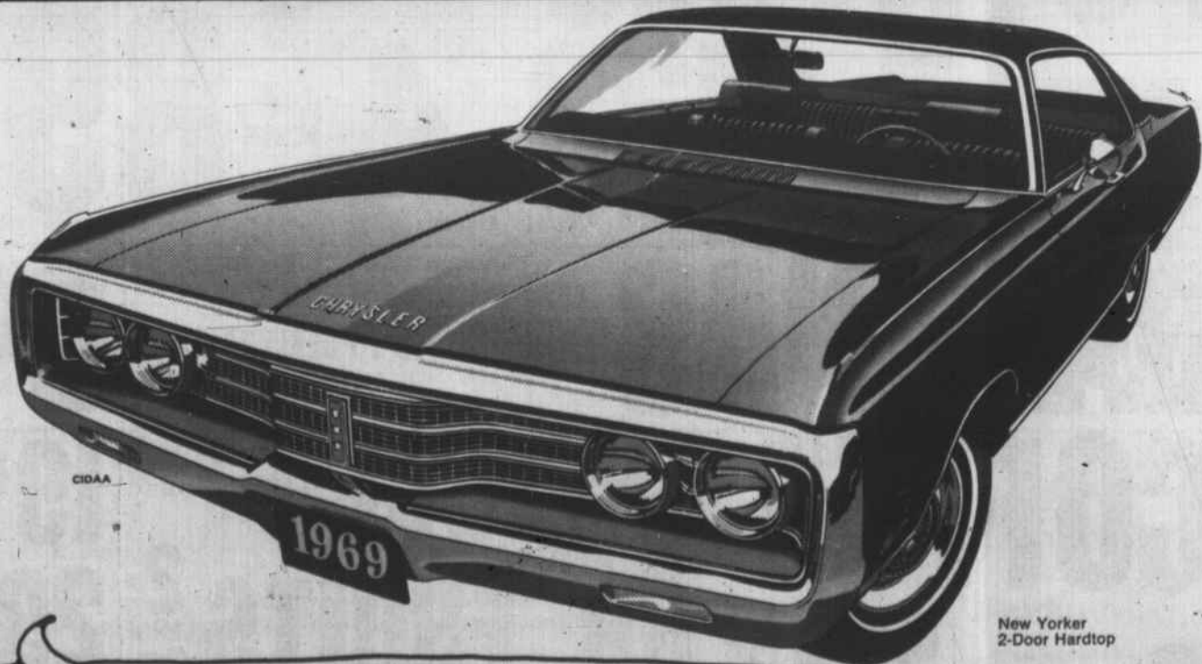
New Yorker 2-Door Hardtop