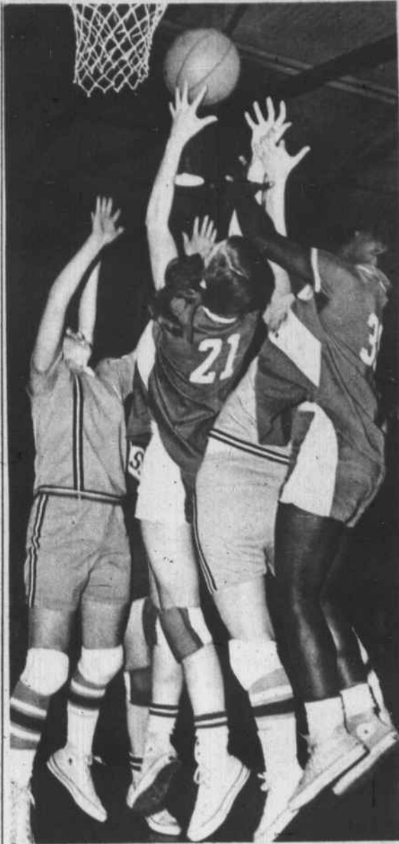
Bunn and Youngsville Girls Bunch Up in Title Tilt.