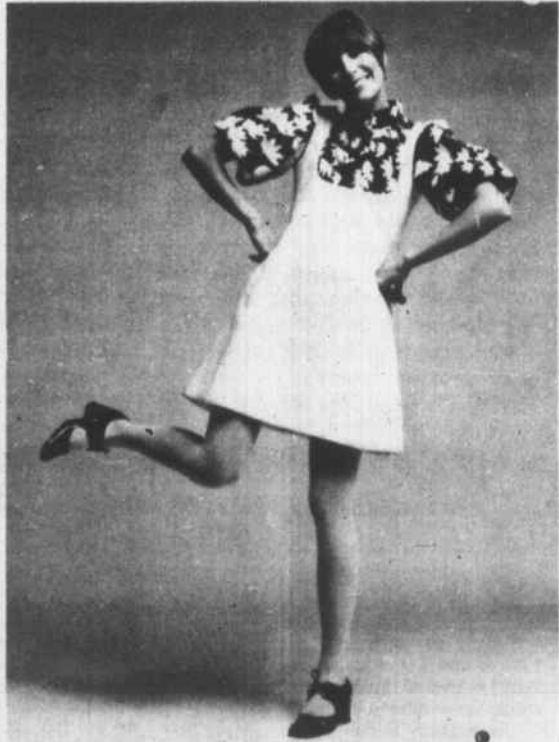
YOUTHFUL—Twice as cute as any button is this princess-styled jumper dress with U-shaped bodice. The black and white cotton blouse with big puffy sleeves and high collar is the perfect foil for the all white cotton pique jumper. Created by Betty Carol for Mam'selle.

When standing correctly the spinal column is designed to be in a straight line. There are segmented curvatures to provide flexibility and absorb stress from the base of the