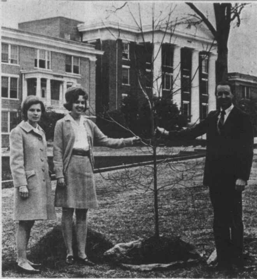
Present Dogwood To College