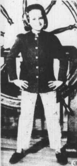
NAUTICAL —The Nehru jacket goes nautical for spring. Concord's twill-weave cotton sail cloth is used in solid navy for the gold-buttoned jacket; in coordinating red, white, and navy checks for trim slacks. The outfit is made from McCall's Pattern 9468.