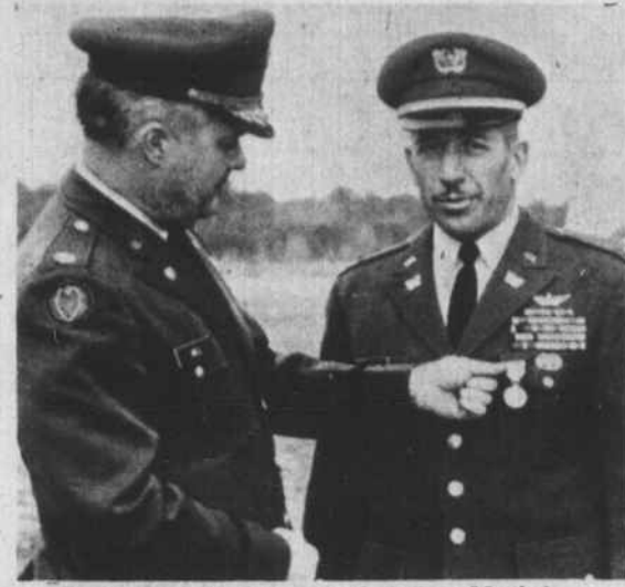
Receives Antarctica Service Medal