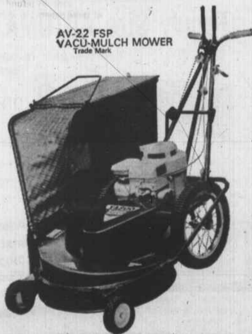
AV-22 FSP VACU-MULCH MOWER Trade Mark

SWEEPS YOUR YARD WHILE IT MOWS YOUR GRASS!