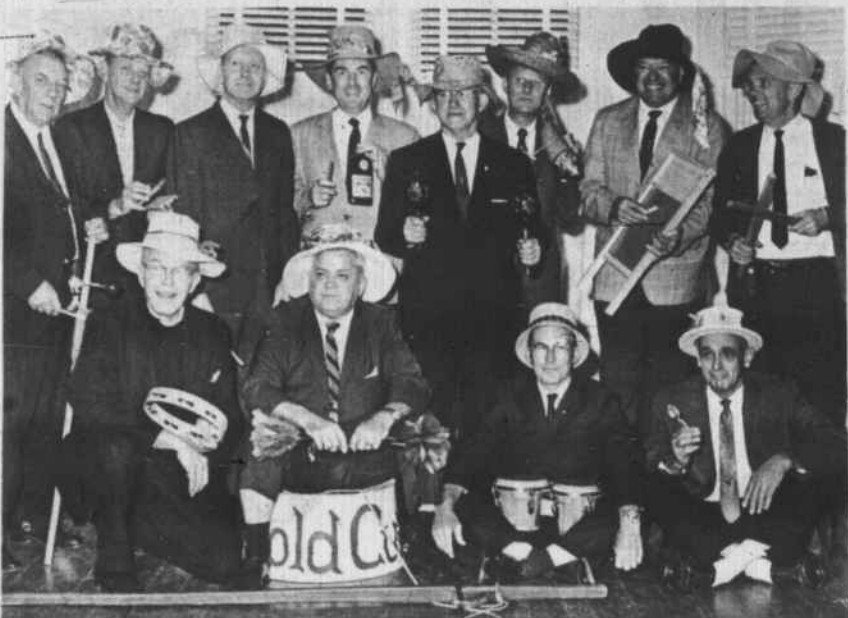
"Cold Cuts" Entertain Episcopal Men