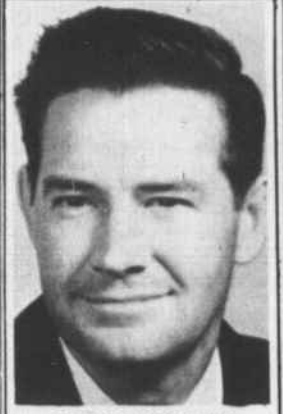
FARM BUREAU LIFE INSURANCE

Unfortunately the man with the loudest mouth often gets the most attention.