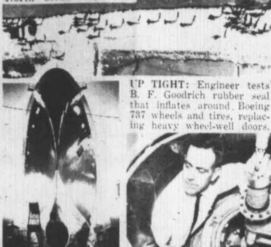
UP TIGHT: Engineer tests B. F. Goodrich rubber seal that inflates around Boeing 737 wheels and tires, replacing heavy wheel-well doors.

WHATZIT? Not airplanes on a runway, but flood workers (and their shadows) sandbagging dike at North Sioux City, S.D.