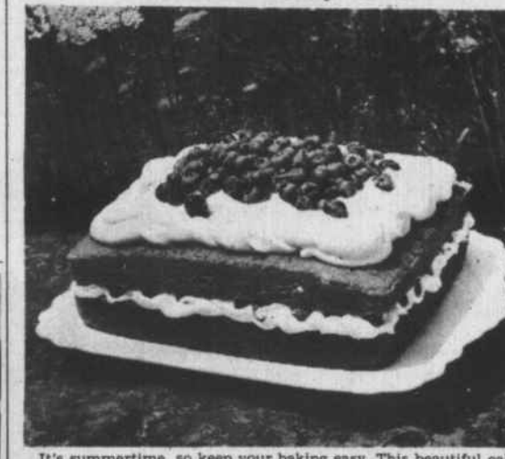
It's summertime, so keep your baking easy. This beautiful cake gets its glamour from a cloud of whipped topping and a generous measure of juicy fresh blueberries. It's made with Swans Down Lemon Flake Cake Mix with an added whiff of spice.