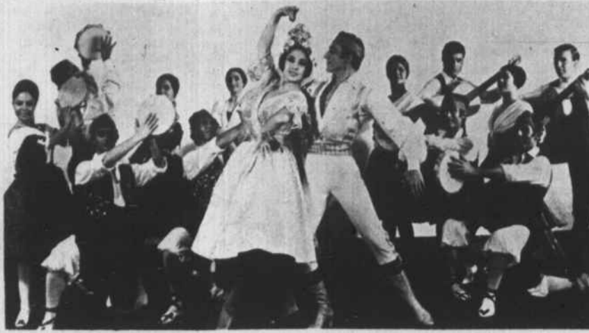
Jose Greco And Dance Company