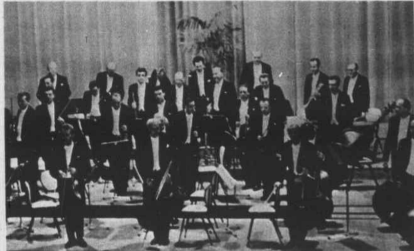
Prague String Orchestra

The smart man who loafs will not accomplish as much as the dull-witted cluck who plugs steadily at his work. This accounts for the relative success of certain people.