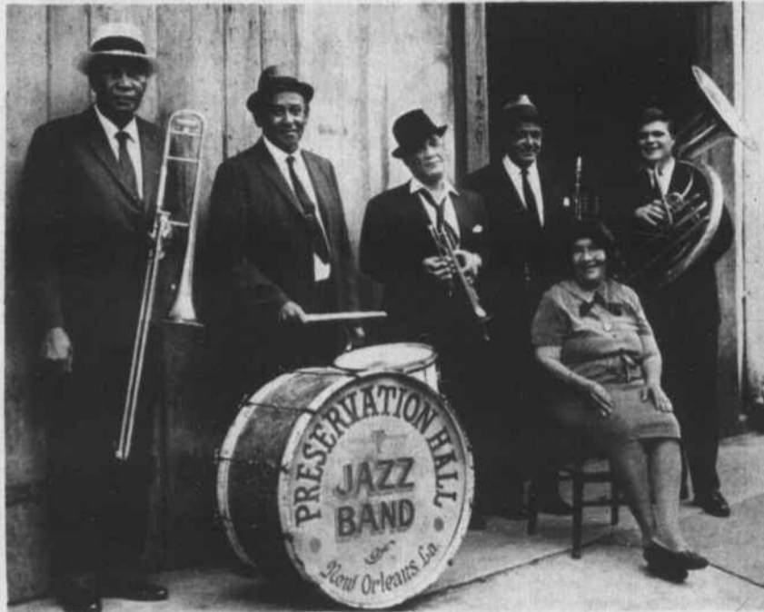
Preservation Hall Jazz