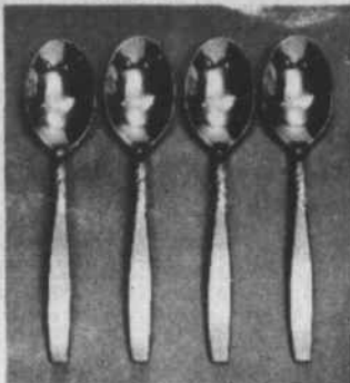
4 SOUP SPOONS

YOU WILL HAVE TO SEE THIS BEAUTIFUL STAINLESS TABLEWARE TO APPRECIATE IT JUST SAVE YOUR REGISTER RECEIPTS SAVE UP TO 50% ASK US FOR DETAILS