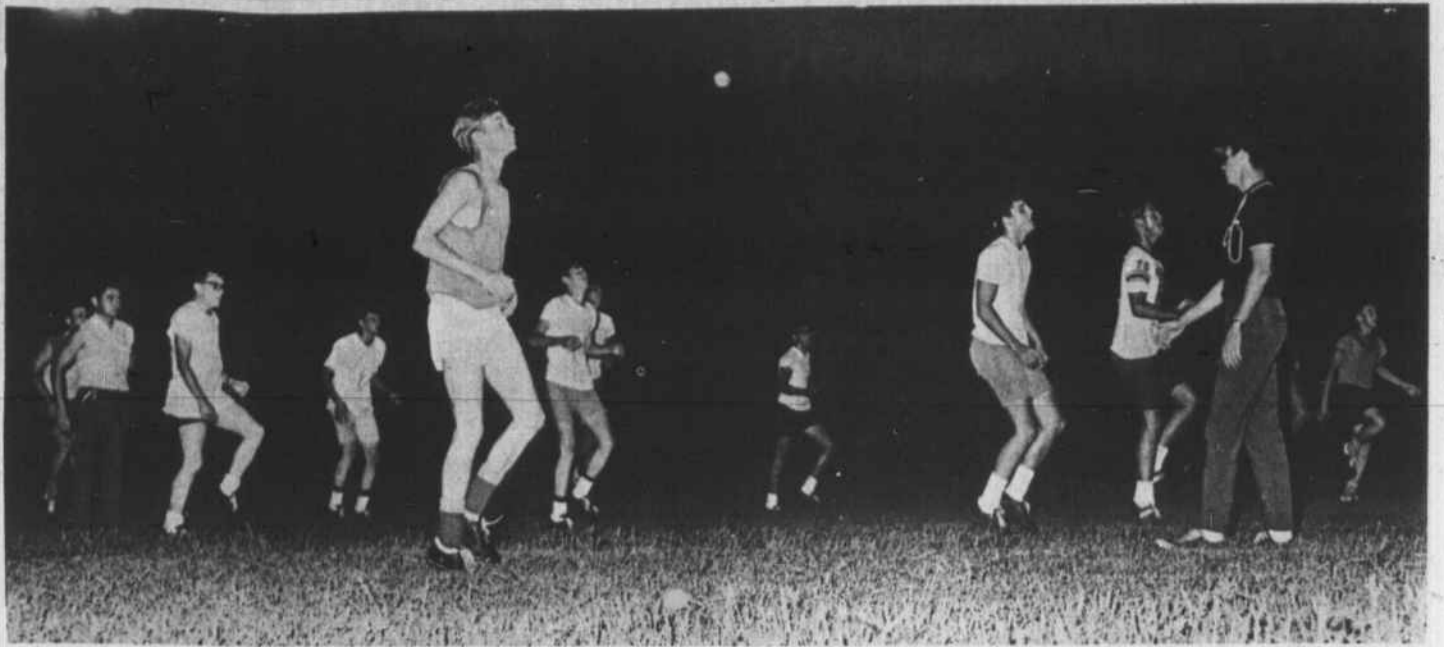
LOUISBURG BULLDOGS LIMBER UP FOR ANOTHER GRID SEASON

The Army ought to be able to use any American who is well enough to hold down a steady job.