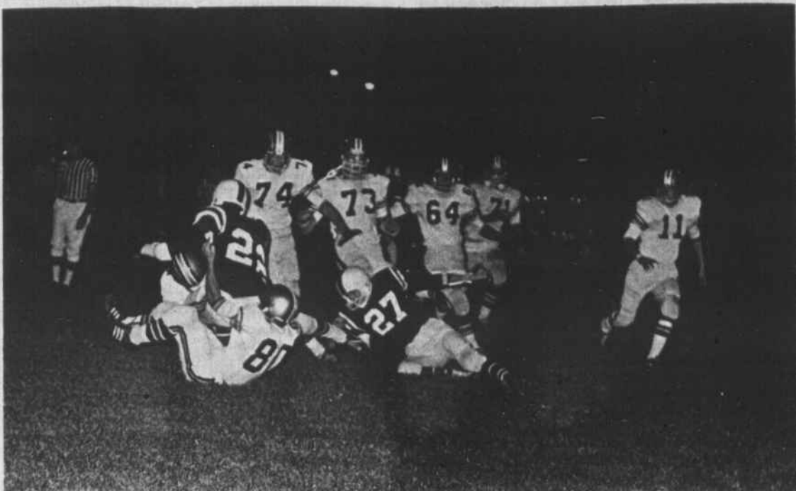
Bulldogs Defense: No Score In 96 Minutes