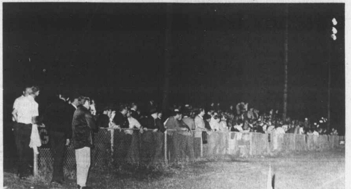
Large Crowd Of Bulldog Fans At Oxford Game

Photos by Clint Fuller and Astor Bowden.