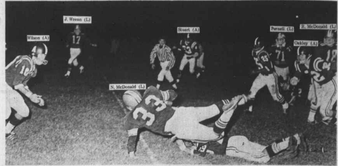
McDonald Bites The Dust