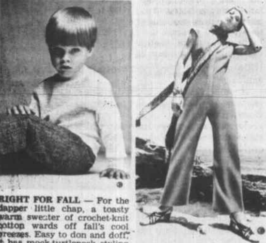
RIGHT FOR FALL - For the dapper little chap, a toasty warm sweater of crocheted-knit cotton wards off fall's cool breezes. Easy to don and doff, it has mock-turtleneck styling and contoured raglan sleeves. By Rob Roy, it comes in buff - one of the season's favorite neutral shades.