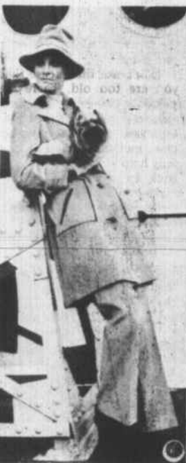
ON DECK - Delightful attire for a brisk morning walk along the deck is this handsome ensemble of cotton corduroy. The Count Romi outfit is completed with a matching hat and a doggie coat.

The hostesses presented Miss Wiggins a cookbook for future use.