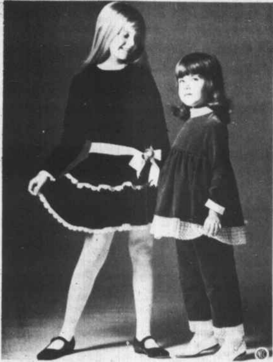
PARTY-FAIR —Two ways to dress for the holidays: in a black cotton velvet dress edged with white lace and ribbon sash (left) or in a deep red cotton velvet dress and pants trimmed with wide lace. Both by Johnston of Dallas.