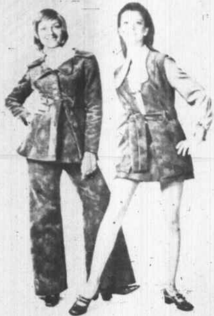
DASHING NEW COTTON —Soft and supple cotton suede with pony-markings gives a luxurious leather look to stylish separates. In Wamsutta's new fabric, the separates include a high-shaped tunic jacket with wide cutaway lapels, bell-bottoms, an ultra-long sleeveless cardigan, and a back-zipped miniskirt. The fashionable four were designed by Young Victorian for Arpeja.