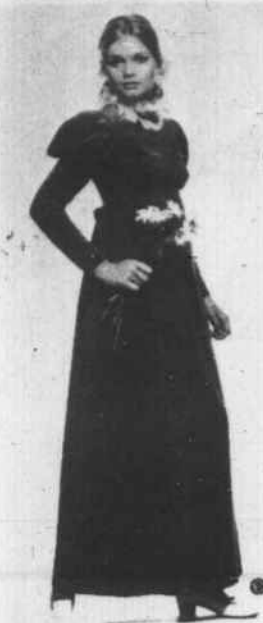
DEMURE —Glowing cotton velvet with its flattering shadowy surface makes a youthful holiday party dress. By Emma Domb, it's styled with a high-necked lace collar and long puffy sleeves.

Holidays and cotton velvet just naturally go together... and this Christmas, velvet dresses are the going thing for party-bound girls of all sizes and ages.