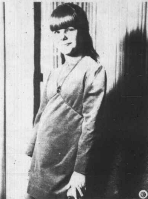
CHAINED VELVET —Rose-colored cotton velvet is Cinderella's choice for a grown-up looking party dress with shaping and seaming. A gold body chain reflects the warm velvet color, and tapered sleeves are formed with a hint of a crown at top.

Bright reds, blues, and mid-night black are favorite colors for the sumptuous-holiday velvets.