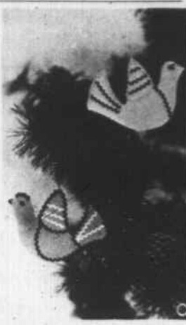
TREE TRIMS —Colorful birds cut from red and white cotton fabric lend a Mexican flavor to holiday trees. Wright's rick rack in contrasting colors adds a decorative touch. No sewing is required for these ornaments which are fused together with iron-on Wonder Under by Pellon.

Free patterns of animal shapes can be obtained by sending a stamped self-addressed envelope to Mexican Tree Trims, National Cotton Council, P. O. Box 12285, Memphis, Tenn. 38112.