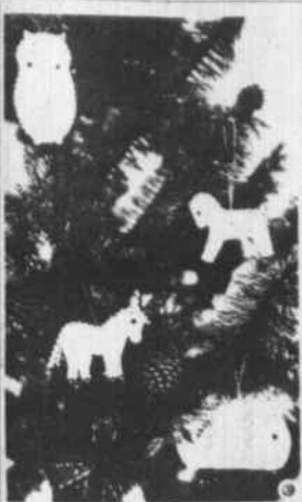
DECORATIVE —Charming animal shapes cut from cotton fabrics and edged with rick rack make tree-trimming fun for the whole family. For free patterns, send a self-addressed stamped envelope to Mexican Tree Trims, National Cotton Council, P. O. Box 12285, Memphis, Tennessee 38112.

Let the decorations on your holiday tree reflect all the color and gaiety of a Mexican Christmas.