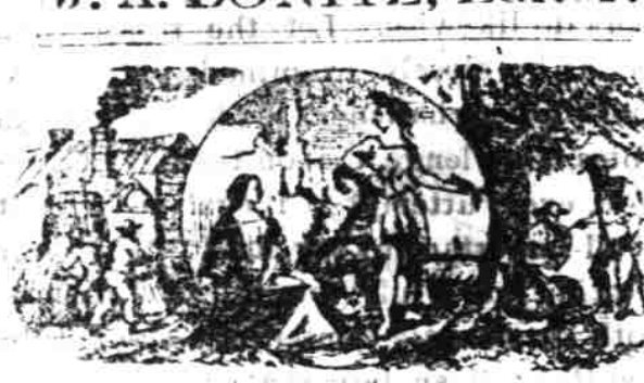
GOLDSBORO, N. C.

REPTHE CIRCULATION OF THE CAROLINA MESSENGER IS NOW business—because negro labor will be-LARGER THAN THAT OF ANY OTHER PAPER PUBLISHED IN tax-gatherers will multiply, and the liber-EASTERN CAROLINA.