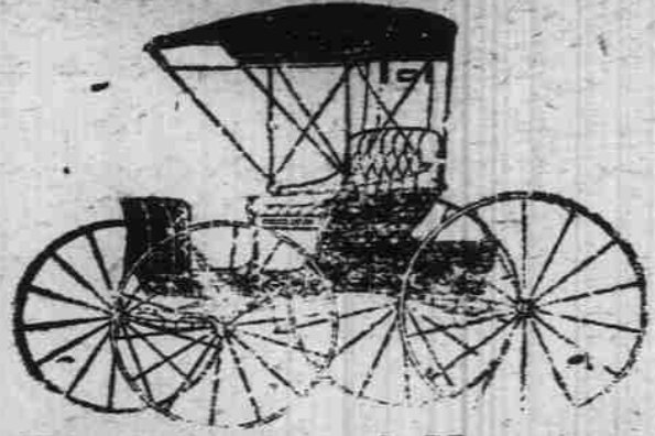
Buggles and Harness