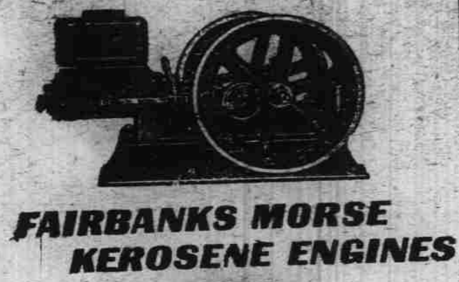
FAIRBANKS MORSE KEROSENE ENGINES