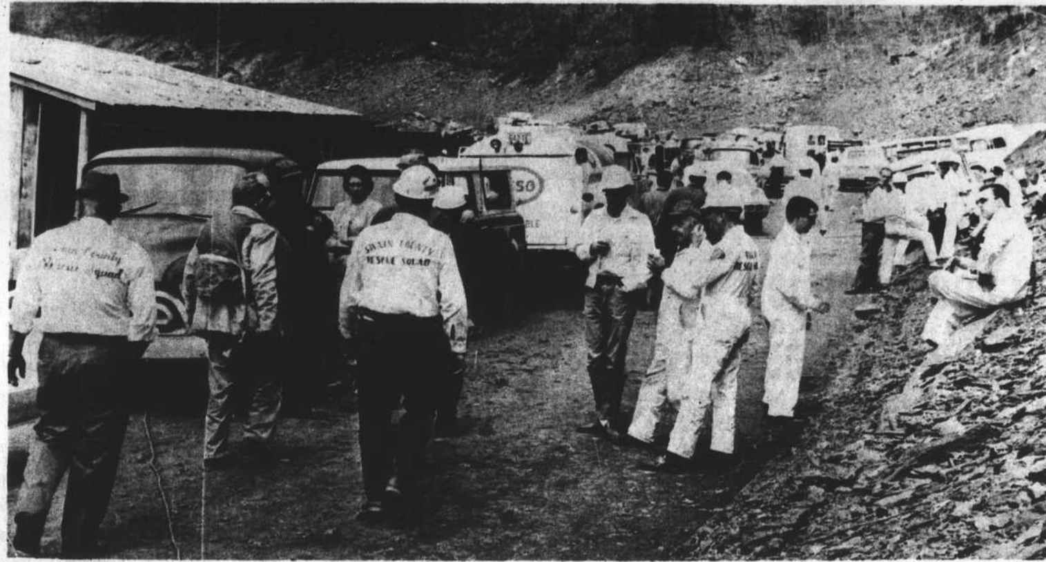
Members of the more than a dozen rescue squads out on the Fontana Lake Sunday morning. are shown above as they take a break between trips

The National Library Week program is sponsored by the National Book Committee, in cooperation with the American Library Association, to provide effective channels for citizen action in developing lifetime reading habits and library resources. The week of April 20 to April 26 has been set aside as National Library Week. With reading and library development as its theme, the National Library Week Program enlists the support of community leaders at the local, state and national levels. It dramatizes the importance of the library as a democratic institution providing free access to adequate information for all—a guarantee of the right of free inquiry and expression in America. Each of the Presidents since the program began has joined their fellow citizens in supporting the National Library Week Program. They have understood its message: that each individual should have free access to adequate information. America has awakened to the fact that an informed community makes for a strong nation. Citizens of North Carolina can be proud of their 352 Public Libraries. Largely supported by local, county, and city funds, these libraries