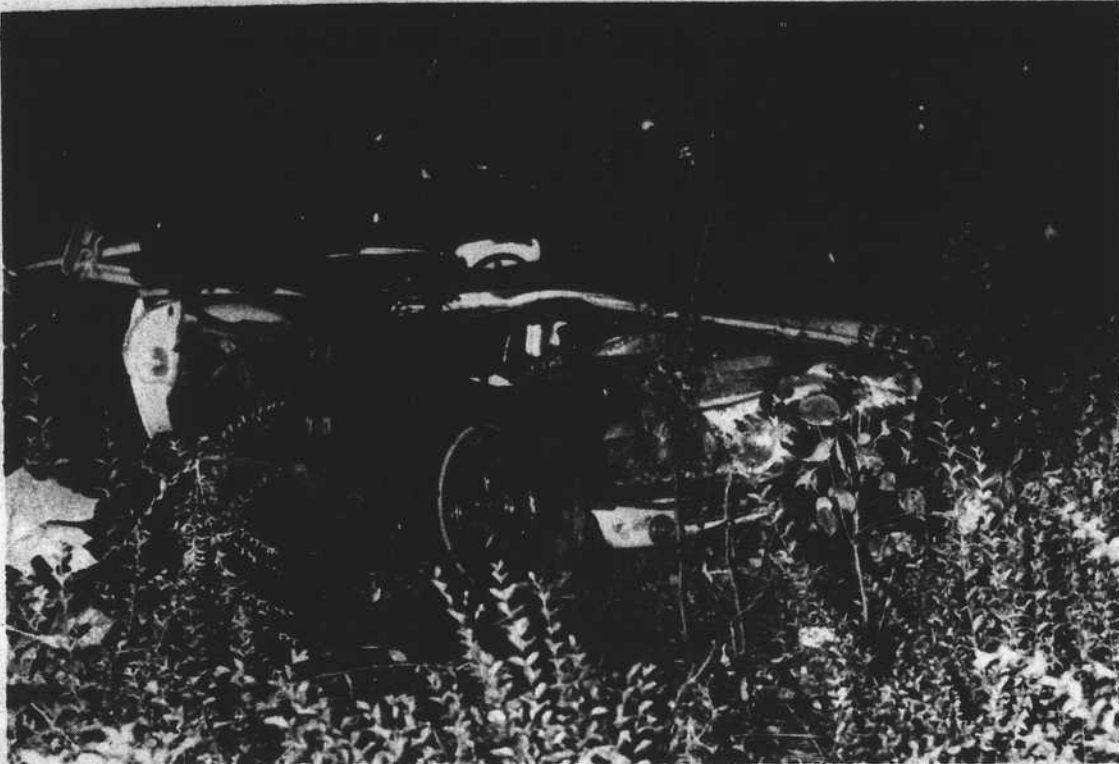
The wreckage of a 1966 Corvette in which a Swain County teenager was killed is pictured above.