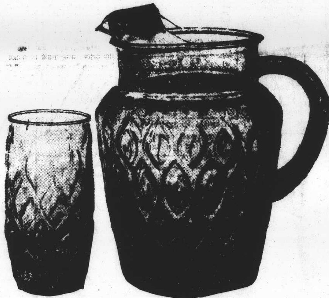
MADRID SPICY BROWN

AT PARTICIPATING PHILLIPS 66 SERVICE STATIONS IN THIS AREA