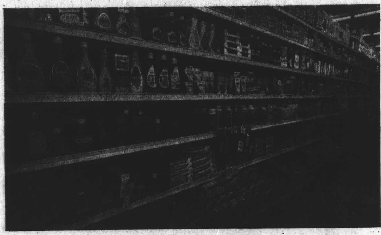
HEALTH AND BEAUTY AIDS