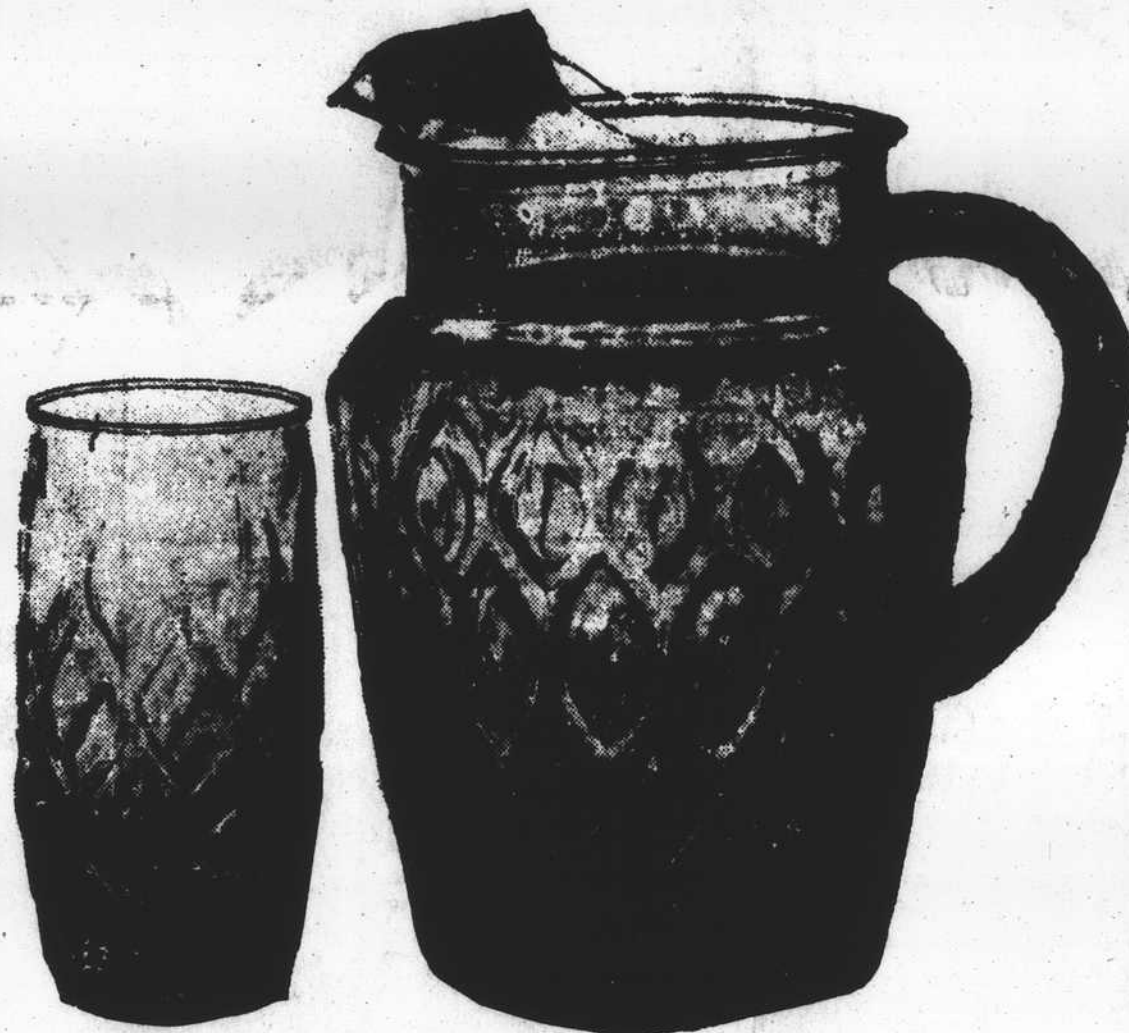
MADRID SPICY BROWN

AT PARTICIPATING PHILLIPS 66 SERVICE STATIONS IN THIS AREA