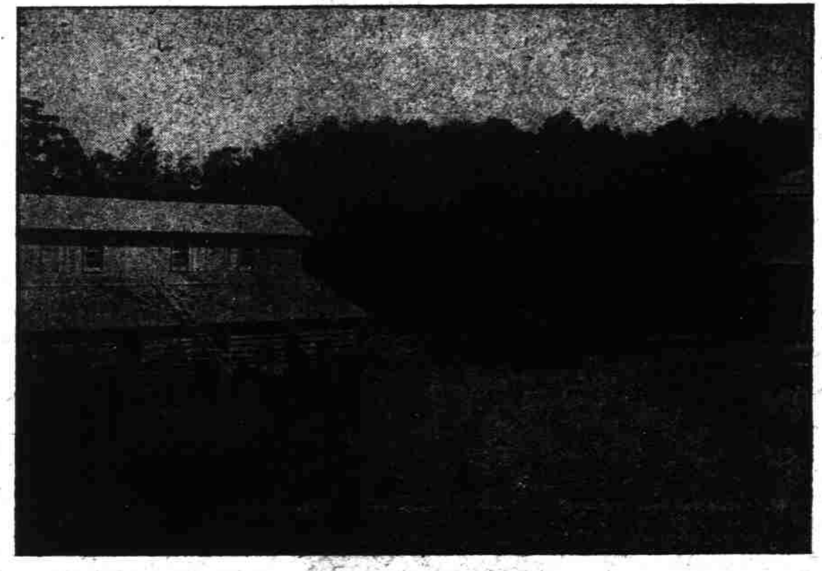
A View of a part of the Albemarle Park, Where the Fair will be held.