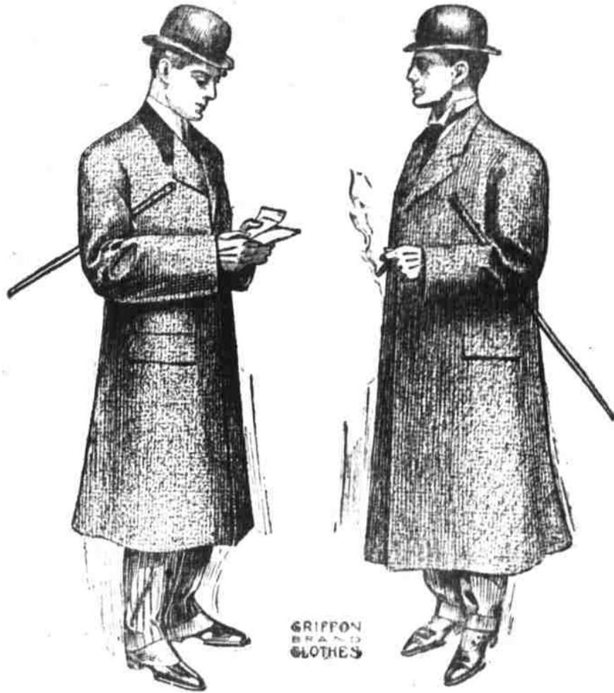
GRIFFON BRAND CLOTHES