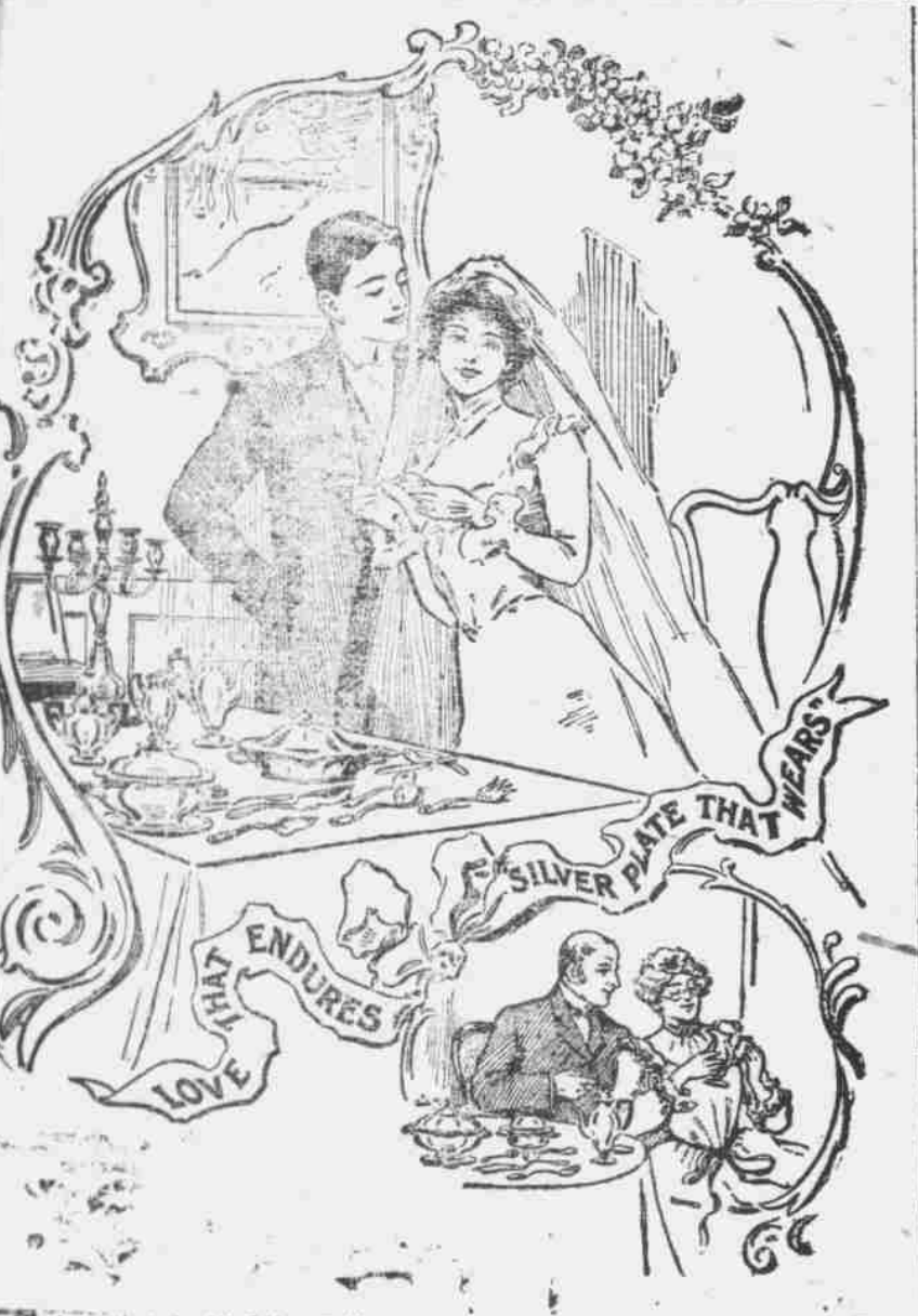
We hear that the Wedding Bells are soon to ring in Lumberton. This is a reminder that you will find something to please the bride.