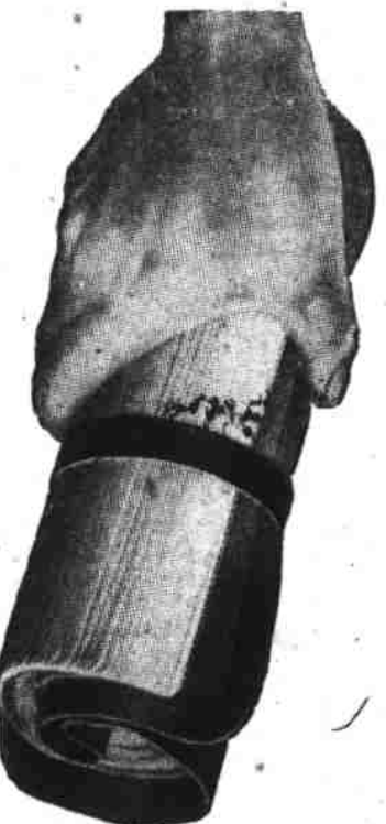
ABSOLUTELY FLEXIBLE BINDING Can be rolled without injury to binding or sewing

The International Bible League aims to create a wider use of the Bible by making it possible for every man, woman and child to possess an attractive edition of the Scriptures like that shown in the illustration. To accomplish this end the League proposes to appoint in each locality a prominent house to act as distributors through whom the people can obtain this beautiful Bible practically free. For the sake of convenience, and in order to obtain the widest possible distribution of these Bibles,