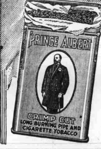
Copyright 1915 R. J. Reynolds Tobacco Co.

R. J. REYNOLDS TOBACCO CO., Winston-Salem, N. C.