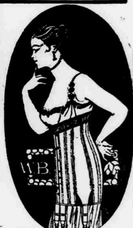
W. B. Nuform, No. 929-$2.00