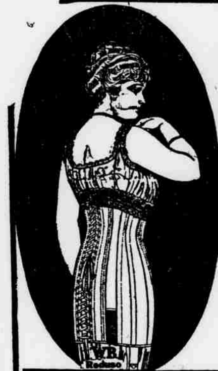
W. B. Reduso, No. 703-$3.50