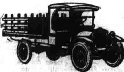
Platform and Convertible Stake Body

If you expect a profit on your truck investment buy a truck that enables your driver to enjoy his work. Commerce Trucks have many appeals to the driver.