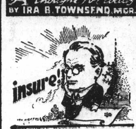
IN THIS LIFE-ITS LIFE INSURANCE