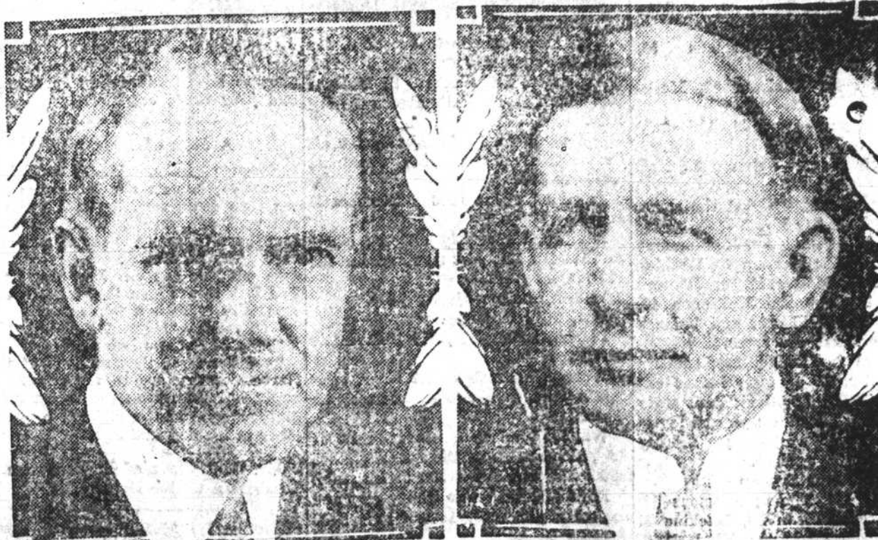
CALVIN COOLIDGE President Elect. CHARLES G. DAWES Vice-President Elect.