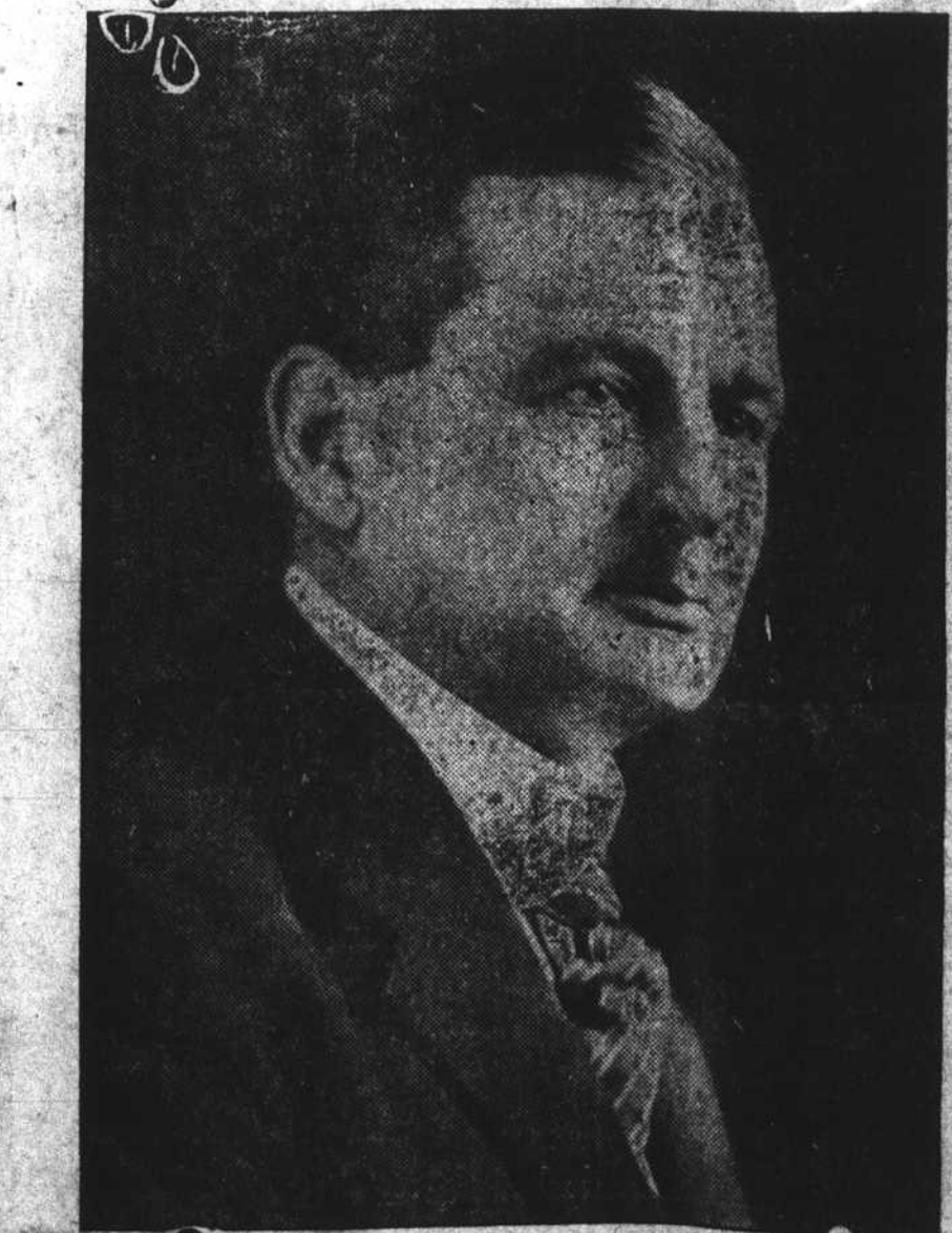
Governor-Elect ANGUS WILTON McLEAN.