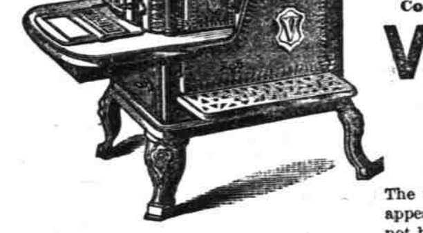
B. C. BIBB & SON Iron Founders, BALTIMORE, MD. Manufacture a desirable line of Heating and Cooking Stoves, including the renowned VIRGINIA COOK.

P. S. A market ready for small desirable farms. Call at once, or address Lock Box 180.